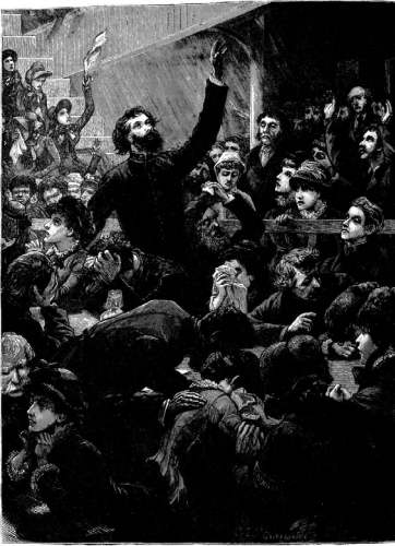
THE SALVATION ARMY—A SERVICE AT THE HEAD-QUARTERS, WHITECHAPEL ROAD

The Salvation Army: a service at its headquarters in Whitechapel Road.