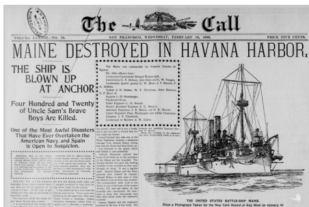
A report on the destruction of the USS Maine. © Library of Congress, Chronicling America (San Francisco Call, February 16, 1898, p. 1).

In addition to these privately created resources, various public bodies in the US have digitised a significant and growing number of newspapers to which the public has free access. The most exciting of these initiatives is the Library of Congress's Chronicling America project. When completed in 2011, this database will include representative newspaper pages from the history of each state from 1836 to 1922. There are many other projects. For example, the Brooklyn Public Library has made available a full run of the Brooklyn Daily Eagle from 1841 to 1902 and plans to digitise the remaining issues for the periods 1903–55 and 1960–3. Rural newspapers have also been digitised, providing distinctive local perspectives. For example, the Northern New York Library Network has digitised full runs of a variety of local newspapers including one dating back to 1811. In addition to newspapers published for a general