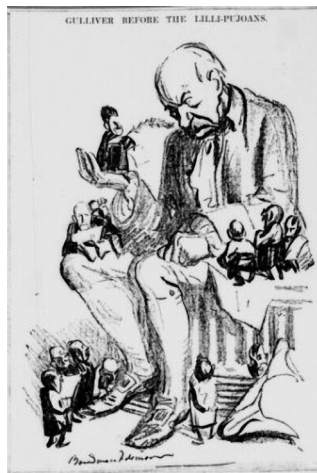
Gulliver before the Lilli-Pujoans. © Library of Congress, Chronicling America (New York Tribune, December 20, 1912, p.1).