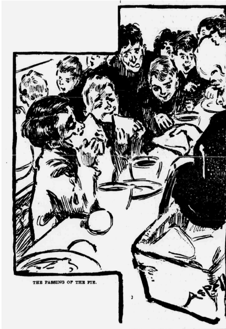
The passing of the pie.

© Library of Congress, Chronicling America ('At the Newsboys' Dinner: Pen Pictures for the Folks Who Couldn't Be There to Enjoy It', New York Sun , February 28, 1904, p. B3).