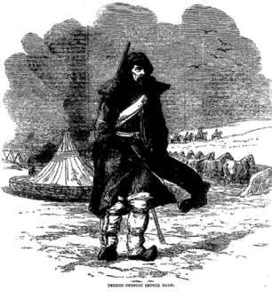
French outpost before Paris ( Penny Illustrated Paper , January 14, 1871, p. 24).

The digitised newspaper resources discussed in this booklet are less useful for European history. Most British undergraduate historians will not be able to access digitised historic newspapers in various European languages, one of the most significant collections being the digitised historic French newspapers available at the French National Library's website http://gallica.bnf.fr However, as shown in the previous case study, the British press did cover major events in 19th-century Europe, in particular wars. Another good example is the Franco-Prussian War of 1870–1 and the Paris Commune of 1871, which was covered in depth by the British press, including a significant number of the newspapers digitised by the British Library. So those students not able to read the official newspaper of the Paris Commune, which