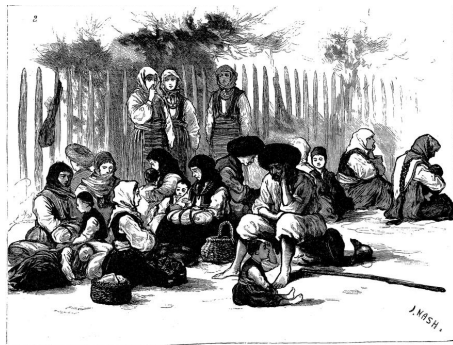
A Beggar gives to the Jewellee Bulgarian—State of the Bulgians. BULGARIAN REFUGEES AT THE SERBIAN HEAD-QUARTERS, PARAKJIN DRAWING BY OUR SPECIAL ARTIST

Bulgarian refugees at the Servian [Serbian] headquarters, Parakjin.